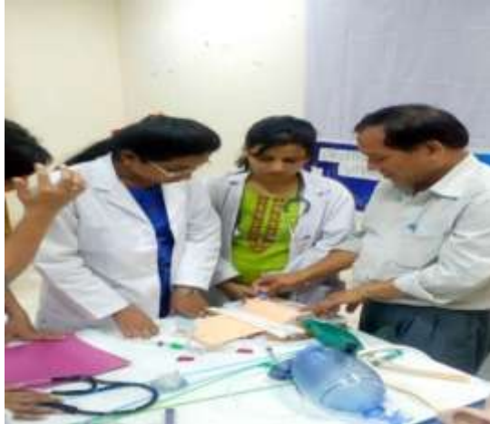
Workshop On Airway Management On 13 th August 2017