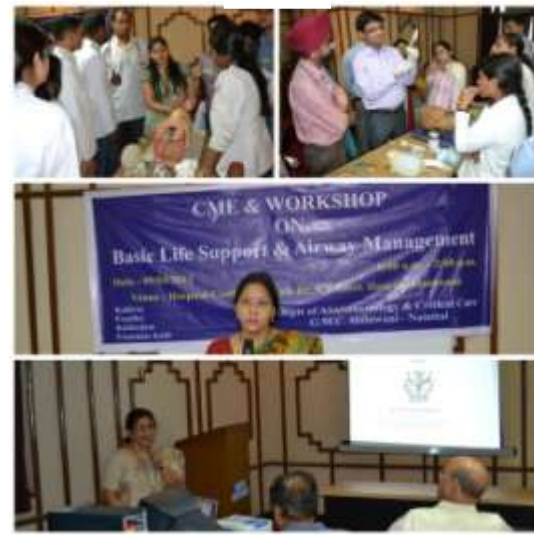
Workshop on BLS & Airway Management – 9 th April 2012