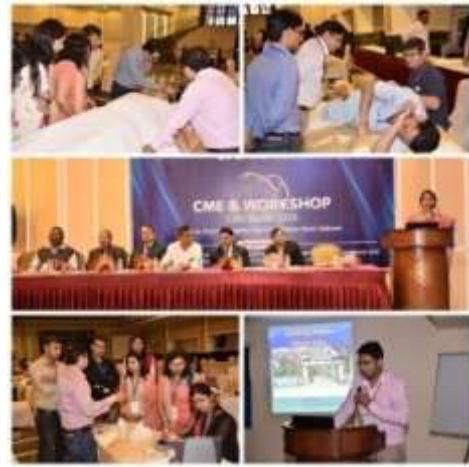
Anaesthesia Updates – 13 th march 2016