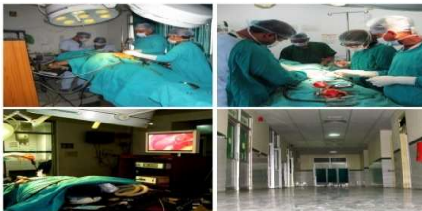
OPERATION THEATRE (OR) AT DR.SUSHILA TIWARI MEMORIAL GOVERNMENT HOSPITAL

Intensive Care Unit: Since August 2018, Beds in Anaesthesiology ICU have been increased from 6 to 12 . Department of anaesthesiology runs a dedicated 12 bedded Anaesthesiology ICU, admitting both post surgical as well as medical patients. Dr.Sushila Tiwari Hospital is the only government hospital in the whole state of Uttarakhand to have 12 bedded ICU