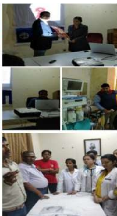
CME On Septic Shock – 28 th August 2018