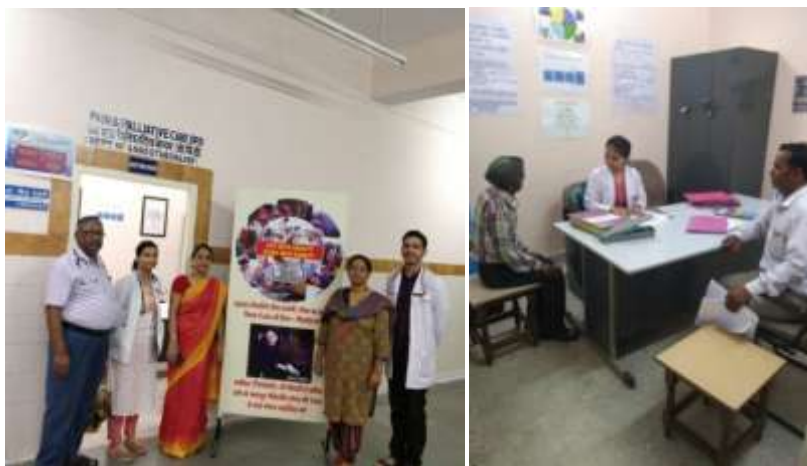
PAIN & PALLIATIVE CARE OPD AT SWAMI RAM CANCER HOSPITAL AND RESEARCH INSTITUTE