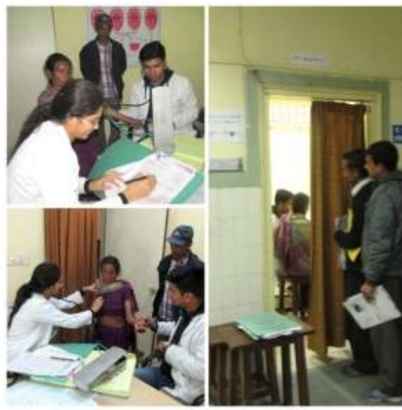
PREANAESTHETIC CHECK UP OPD ROOM NO.12 AND PAIN CLINIC ROOM NO 12 A AT DR.SUSHILA TIWARI MEMORIAL GOVERNMENT HOSPITAL

Operation theatres: The hospital has 14 Major & 04 Minor Operation theatres including 02 super speciality & 03 Emergency Operation theatres. All the OT's are highly equipped with modern anaesthesia workstations, multiparametric monitors, EtCo2 monitors, and invasive monitoring like IBP/CVP.