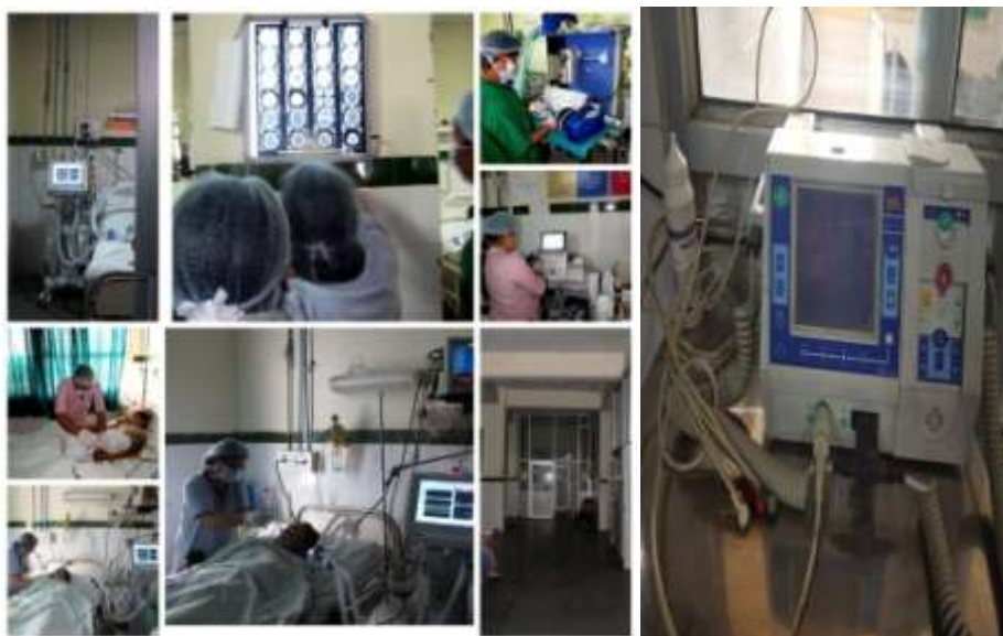
ANAESTHESIOLOGY INTENSIVE CARE UNIT (AICU BED NO 1 – 12) AT DR.SUSHILA TIWARI MEMORIAL GOVERNMENT HOSPITAL

Intensive Care Unit: Since August 2018, Beds in Anaesthesiology ICU have been increased from 6 to 12 . Department of anaesthesiology runs a dedicated 12 bedded Anaesthesiology ICU, admitting both post surgical as well as medical patients. Dr.Sushila Tiwari Hospital is the only government hospital in the whole state of Uttarakhand to have 12 bedded ICU