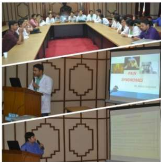
CME on Cancer & Pain Syndromes – 13 th November ,2013