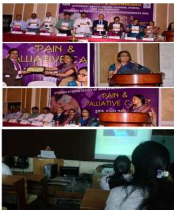
CME On Compression Only CPR, Importance Of Intensive Care & Palliative Care – 16 th AUGUST 2018