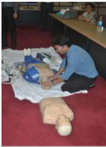
Life Saving Intubation /Airway Management Programme: 4-14 th FEBRUARY 2015