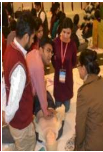
Emergency Resuscitation Programme, 25 th May-13 th June 2015.